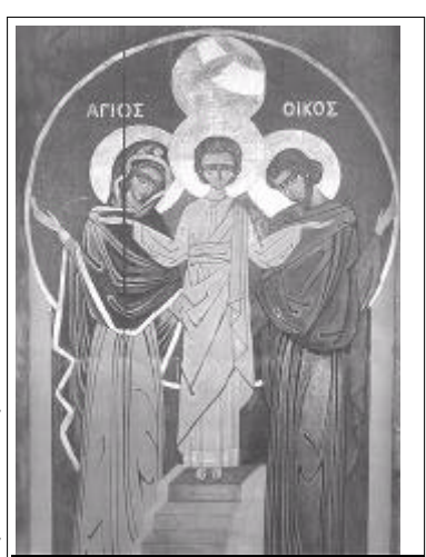
This Icon of the Holy Family has been adopted by the ACF for special devotion

practical concept of the independence of the spouses in relation to each other; serious misconceptions regarding the relationship of authority between parents and children; the concrete difficulties that the family itself experiences in the transmission of values; the growing number of divorces; the scourge of abortion; the ever more frequent recourse to sterilization; the appearance of a truly contraceptive mentality." Recently the Pope defined this degradation of societies values as "The Culture of Death."